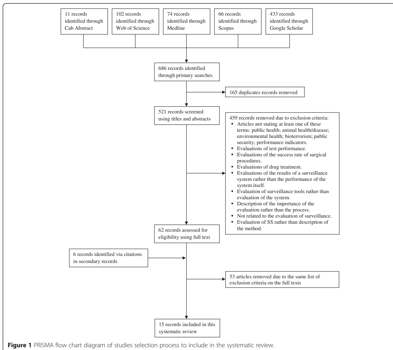
Figure 1 PRISMA flow chart diagram of studies selection process to include in the systematic review.

Among the identified approaches, ten originated from the public health surveillance field [5,18-26]; three from animal health surveillance [27-29]; one from environmental